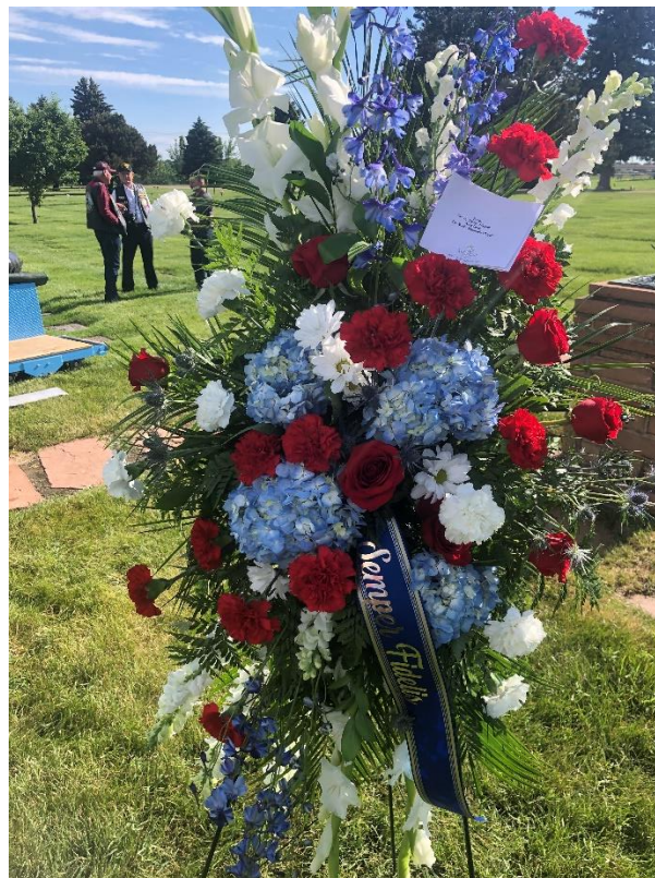
Wreath presented by FMDA-RMC on 26 June 2021